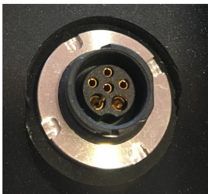
Image: Example of a well-used but good data connector - Pass

Image: Example of a good data connector - Pass