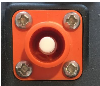
Image: Failure - Example of a damaged positive power connector, the pin is no longer centered

Image: Pass - Example of a good and functional positive power connector