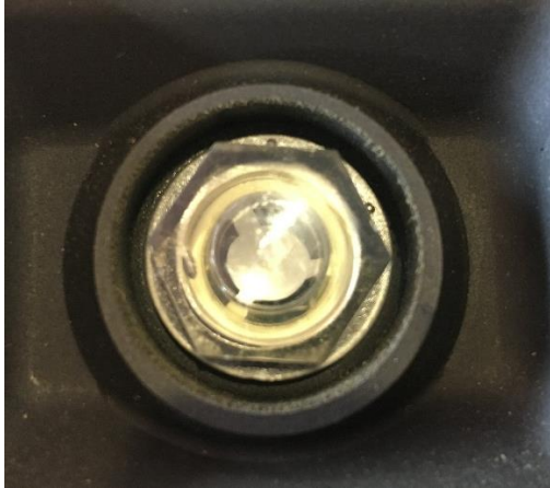
Image: View port Failure – Water label has changed the colour to RED → This means it has been in contact with water. IMPORTANT: Immediately move the battery to an outdoor open non-flammable area. Contact Fliteboard via the phone or email to support@fliteboard.com )