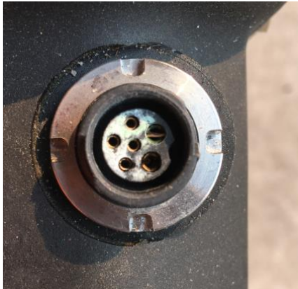
Image: Example of a data connector failure – Connector housing is damaged

Image: Example of a data connector failure – One pin is blocked, also needs contact cleaner applied to reduce corrosion