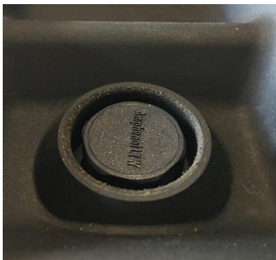
Image: Gore valve (Pass – Gore valve is all the way in, no movement)

Failure: Gore valve is loose and sticks out of the case