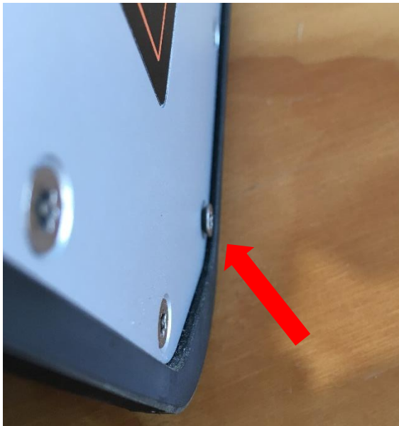
Image: Overview of some feature of the Flitecell frame